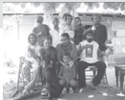
El Cobre, group gathered for interview